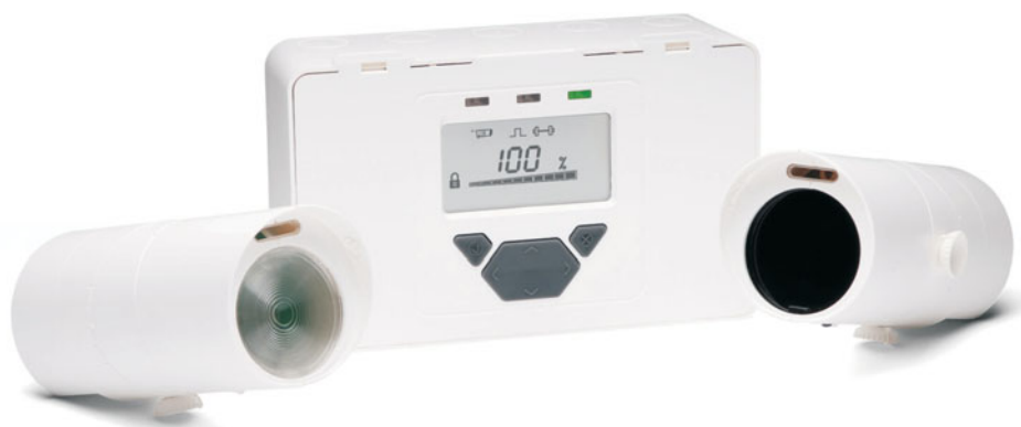
Additional Detector Pack