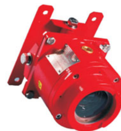
Optional Wall Mounting Bracket