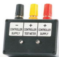
Alignment Aid Tool

The Alignment Aid Tool is a stand alone accessory that can be positioned either with the low level controller or remotely, to facilitate alignment and testing from a convenient low level location in the safe area.